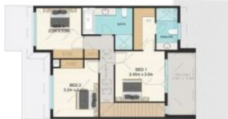
UPPER FLOOR PLAN - LOT 3 (MIRROR FOR LOTS 2 & 4)