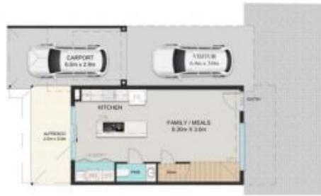
LOWER FLOOR PLAN - LOT 3 (MIRROR FOR LOTS 2 & 4)