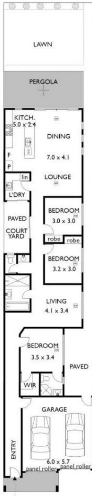
53A Minns Street East Seaton

For illustrative purposes only. All measurements are approximate.